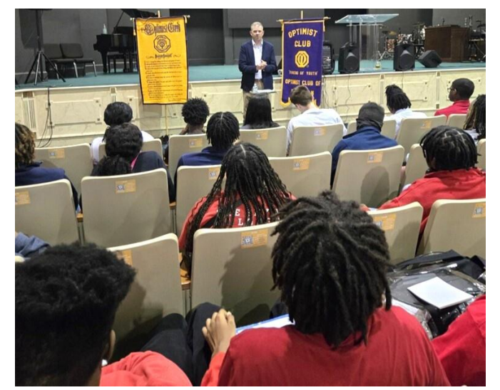
U.S. Magistrate Judge Gray Borden speaking with students.