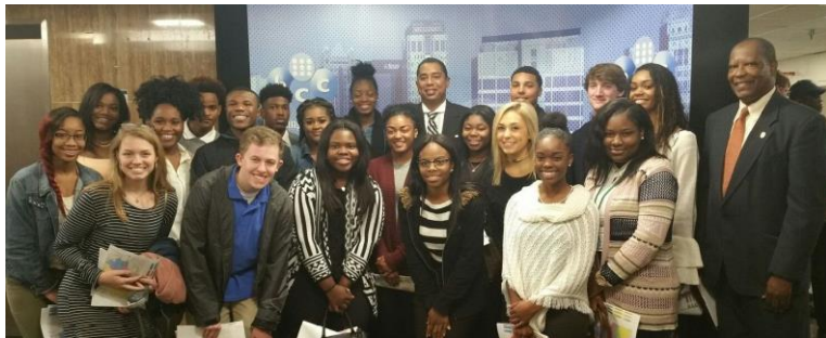
Youth Appreciation Day 2017